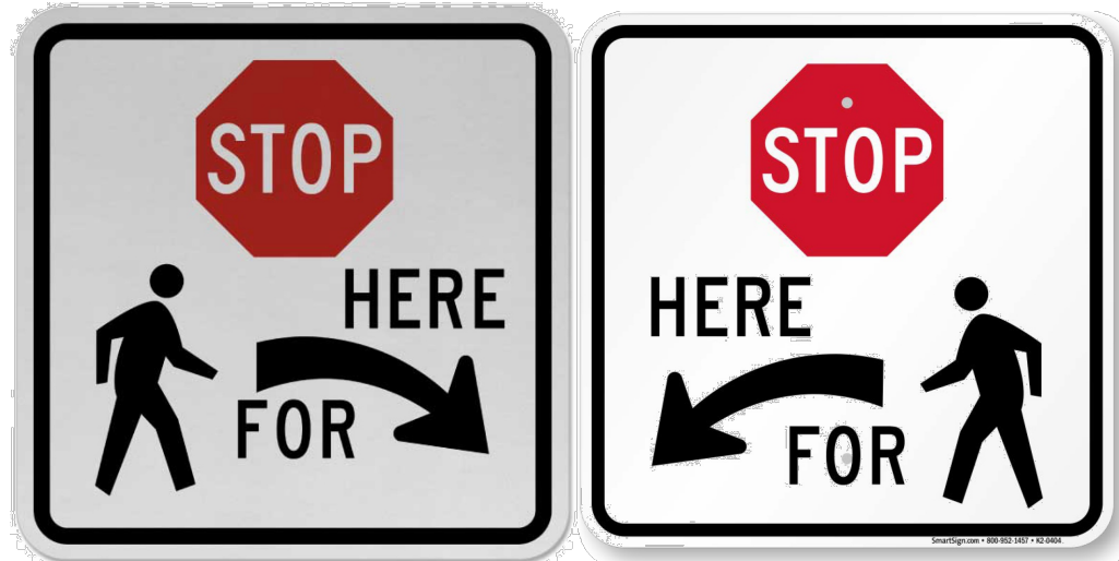
TYPICAL R1-5 SIGNS N.T.S.